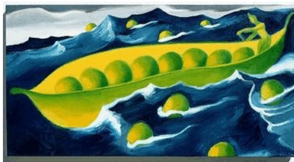
Assistance while sailing new seas